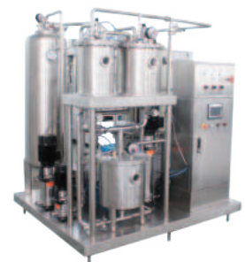
Carbonator/ CO 2 Mixer