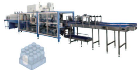
Half-Tray Packing Machine