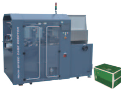
Carton Forming Machine